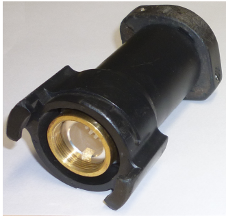
For liquid cooled machine

Robust induction cable specially made for the use with Miller ProHeat 35 induction machines. Improved resistance to mechanical and thermal stress. 35 KW power output without cooling liquid in the induction cable. Available with connections for either air-cooled or liquid-cooled machines.